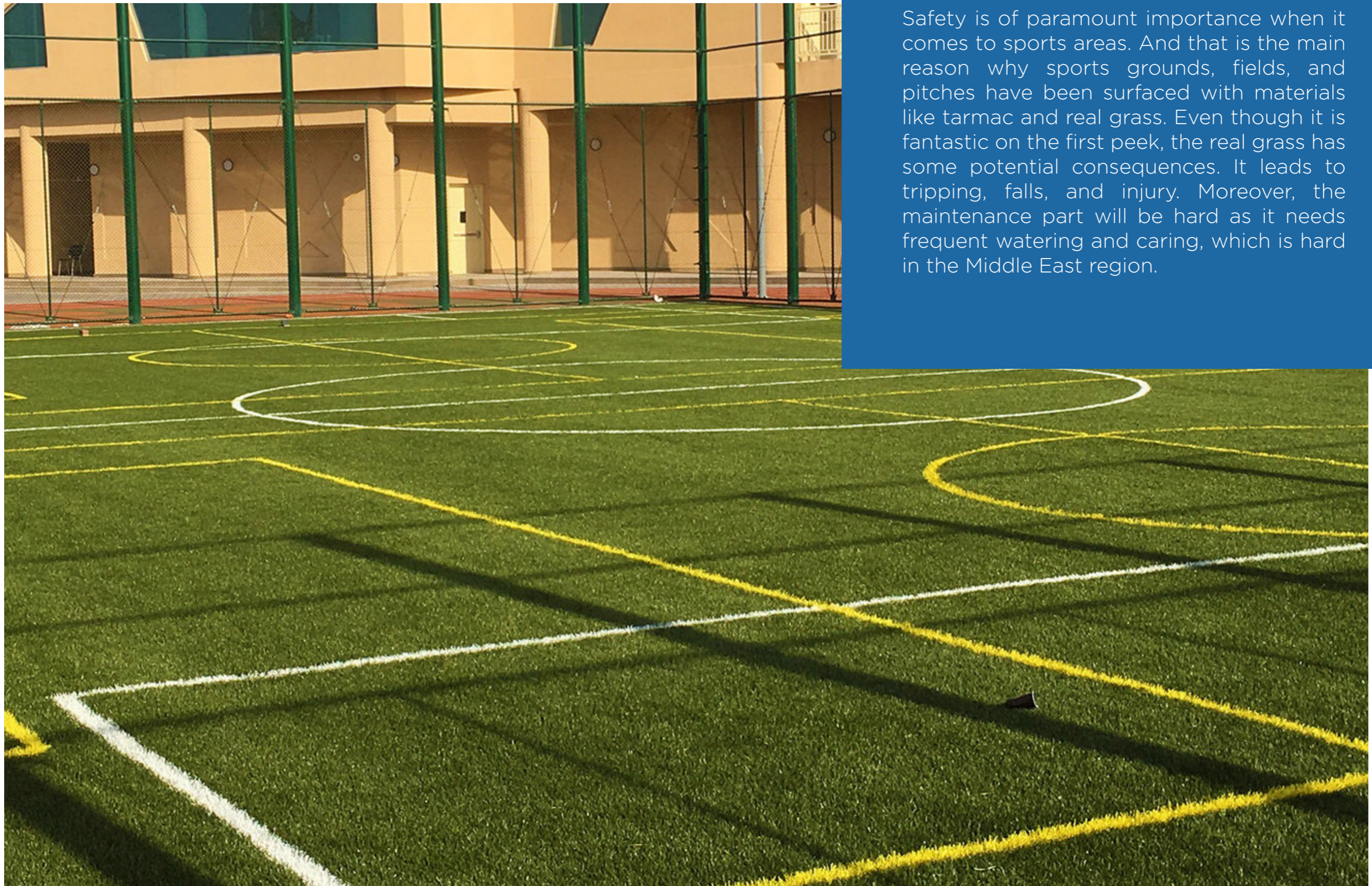
AMERICAN SCHOOL, DUBAI, UAE

Safety is of paramount importance when it comes to sports areas. And that is the main reason why sports grounds, fields, and pitches have been surfaced with materials like tarmac and real grass. Even though it is fantastic on the first peek, the real grass has some potential consequences. It leads to tripping, falls, and injury. Moreover, the maintenance part will be hard as it needs frequent watering and caring, which is hard in the Middle East region.