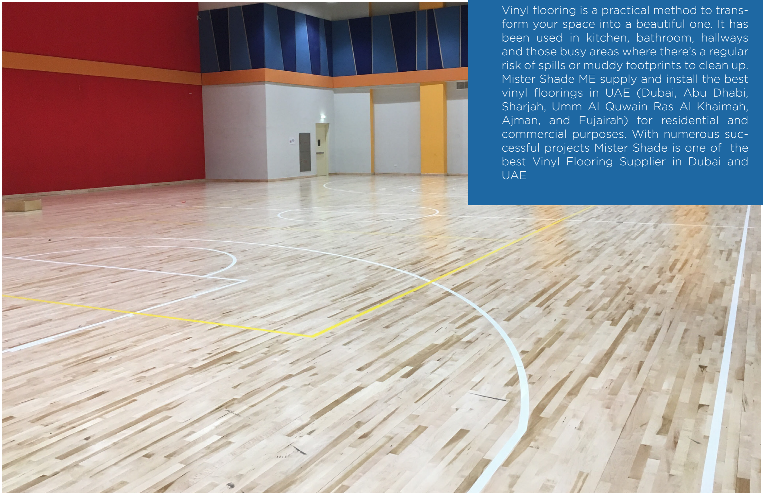
AMERICAN SCHOOL, DUBAI, UAE

Vinyl flooring is a practical method to transform your space into a beautiful one. It has been used in kitchen, bathroom, hallways and those busy areas where there's a regular risk of spills or muddy footprints to clean up. Mister Shade ME supply and install the best vinyl floorings in UAE (Dubai, Abu Dhabi, Sharjah, Umm Al Quwain Ras Al Khaimah, Ajman, and Fujairah) for residential and commercial purposes. With numerous successful projects Mister Shade is one of the best Vinyl Flooring Supplier in Dubai and UAE