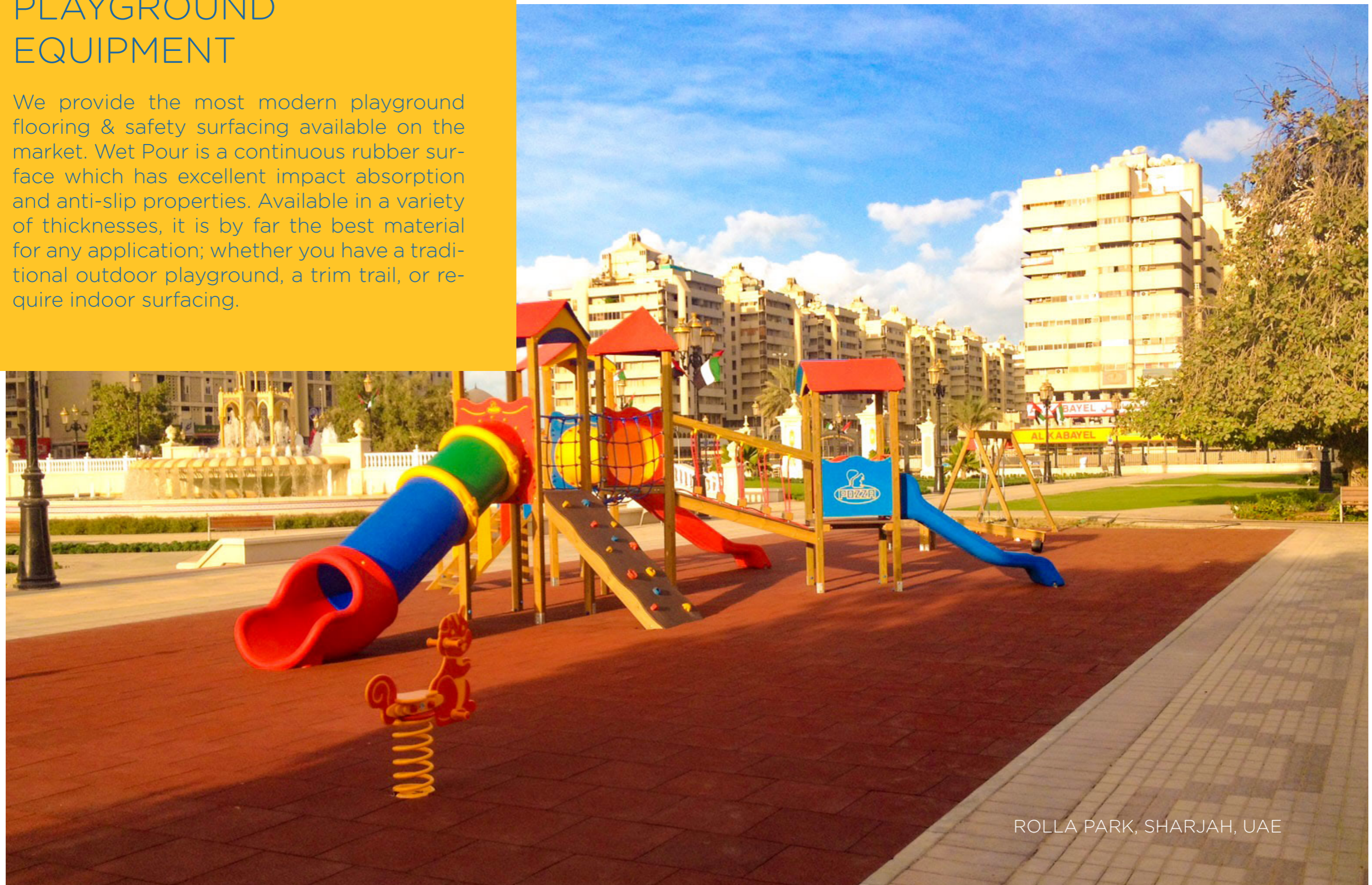
ROLLA PARK, SHARJAH, UAE

We provide the most modern playground flooring & safety surfacing available on the market. Wet Pour is a continuous rubber surface which has excellent impact absorption and anti-slip properties. Available in a variety of thicknesses, it is by far the best material for any application; whether you have a traditional outdoor playground, a trim trail, or require indoor surfacing.