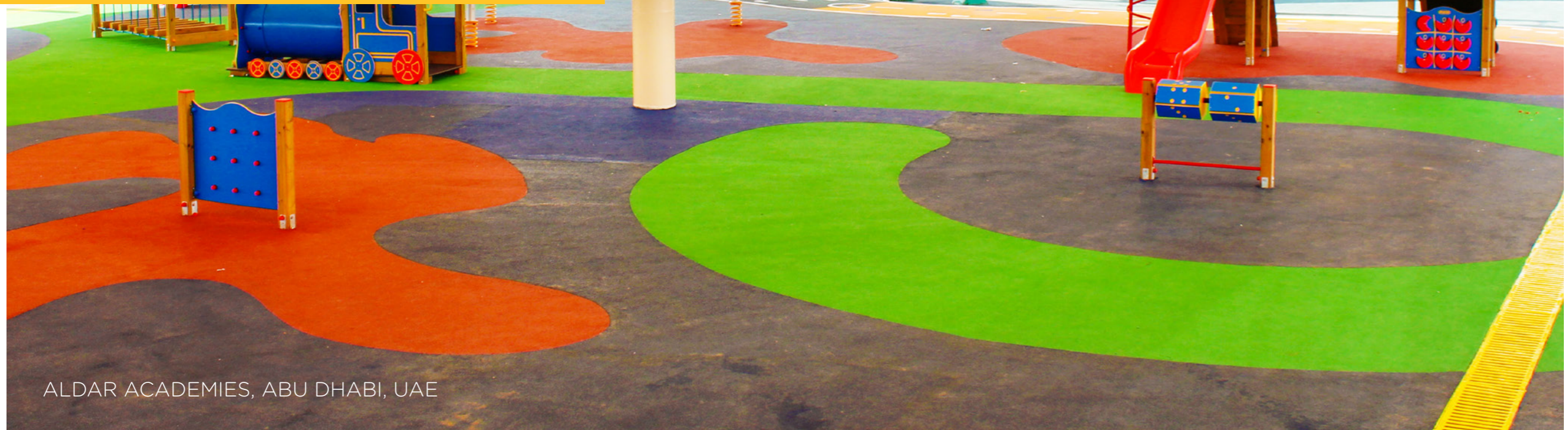
ALDAR ACADEMIES, ABU DHABI, UAE

The play areas are natural learning and teaching environment for young children. It is one place where they should feel that they are capable and settled. Most of the educational institutions such as schools and nurseries install playground equipment since it caters for all children's physical, mental, cognitive, linguistic, emotional, and social needs. Mister Shade ME manufacture and install the best School Play Equipment all over the UAE (Dubai, Abu Dhabi, Sharjah, Ras Al Khaimah, Umm al Quwain, and Fujairah) and the Middle East region. We're experts in outdoor recreation, and our products are chosen by the leading educational institutions in the region