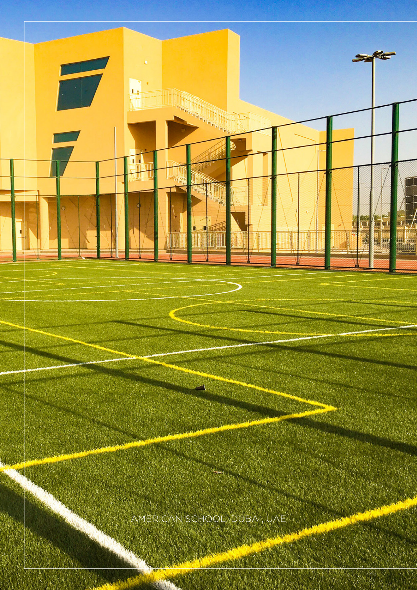
AMERICAN SCHOOL, DUBAI, UAE