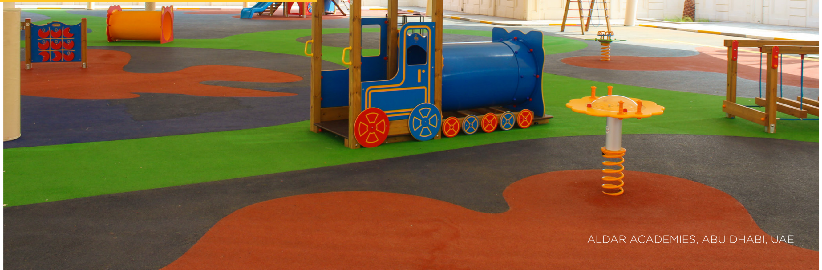
ALDAR ACADEMIES, ABU DHABI, UAE

Mister shade ME supply and install the epoxy flooring in and across UAE (Dubai, Abu Dhabi, Sharjah, Ajman, Fujairah, Ras Al Khaimah, and Umm Al Quwain) and the Middle East.